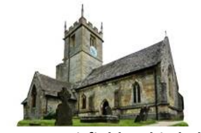
Hampton – Fairfield – Thistledown Eastwick Park – Charity Crescent